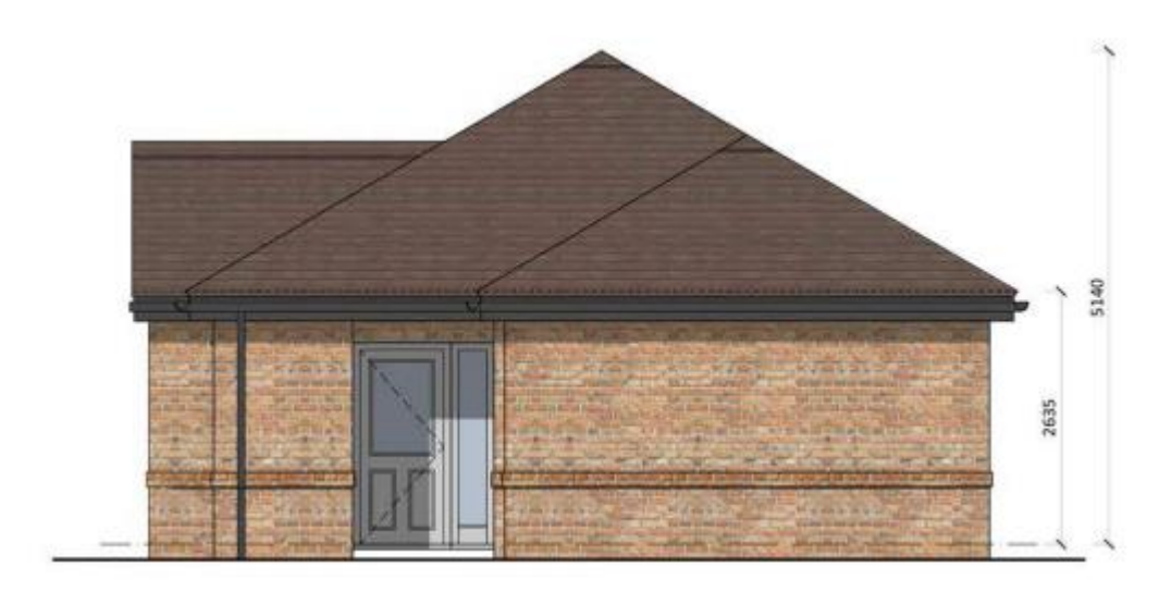
Front Elevation (south)