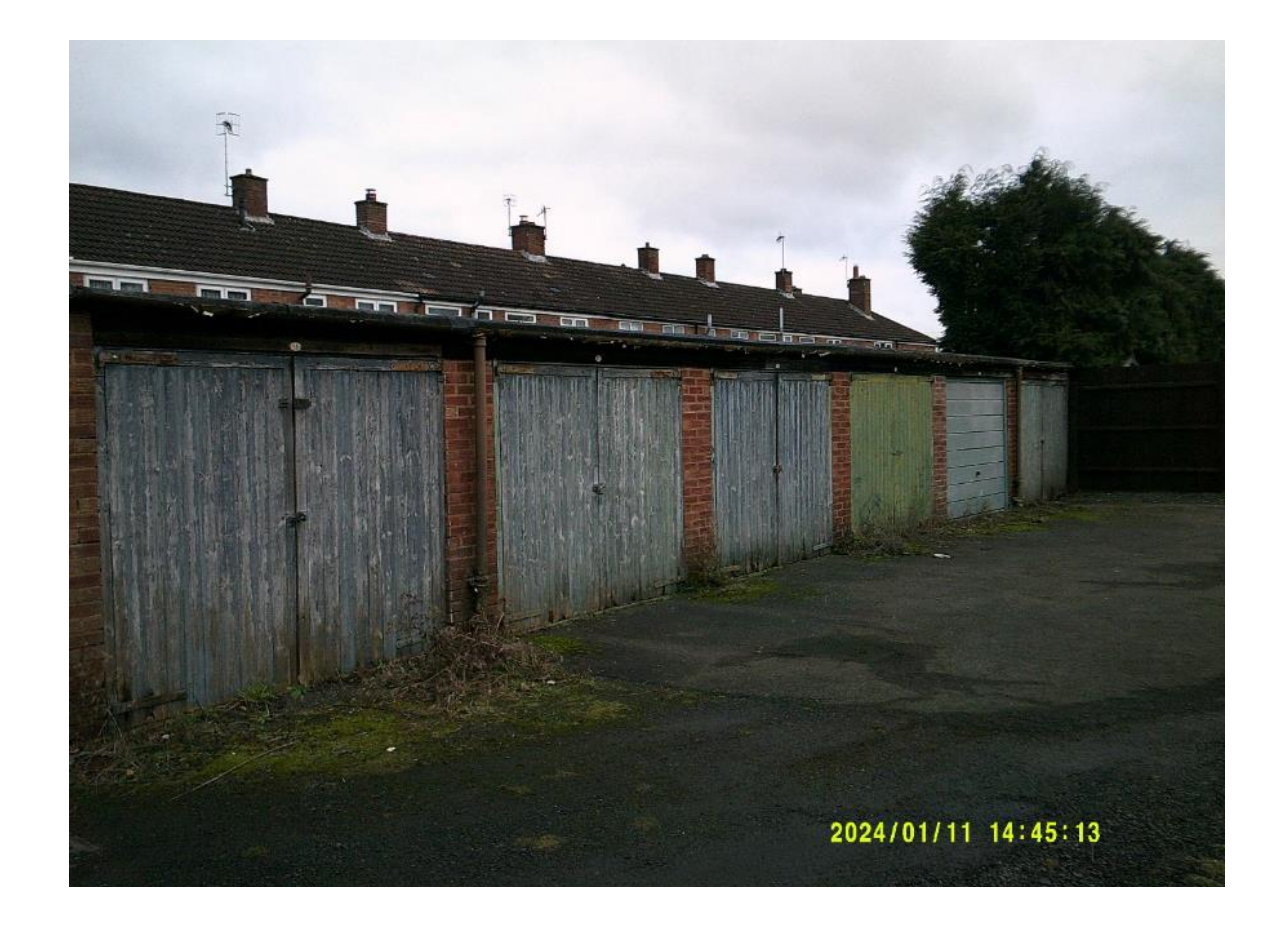
View looking east towards rear of 14-18 Church Road