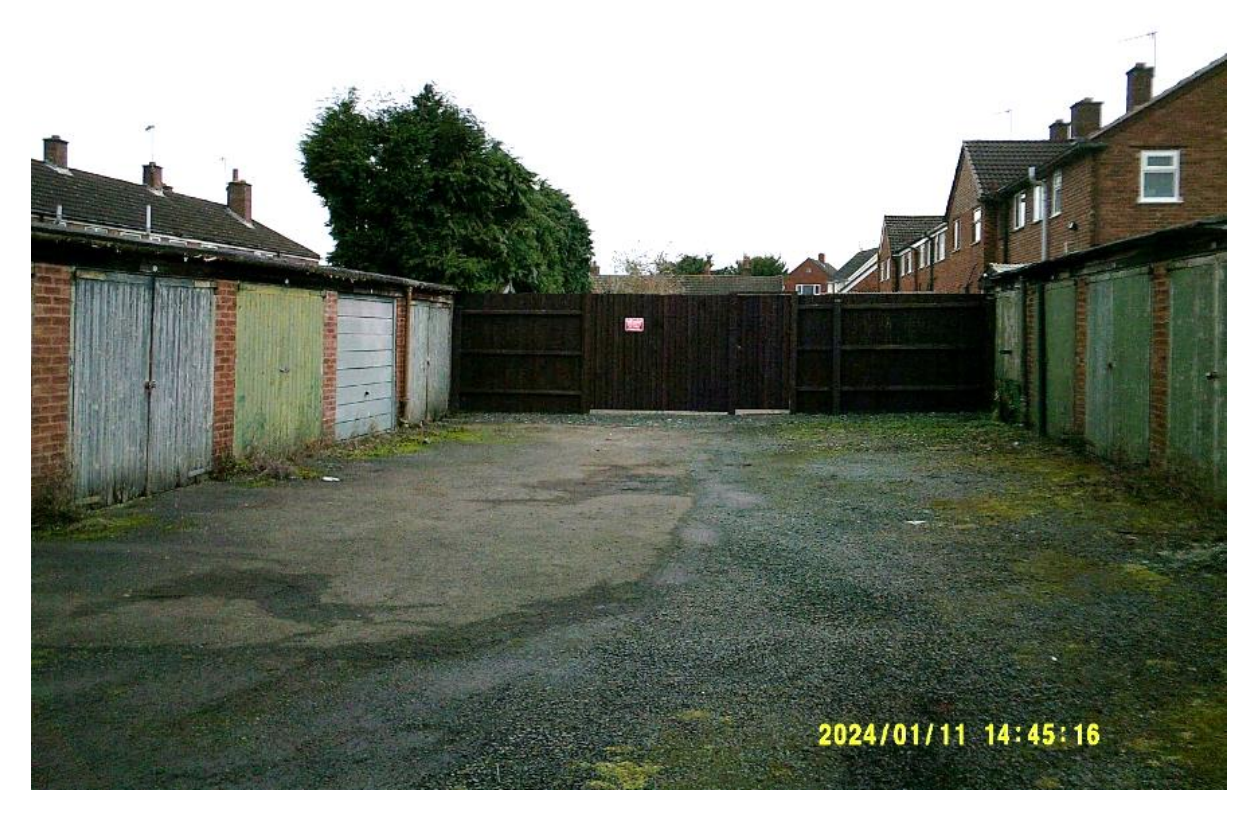
View looking north towards No.12 Church Road garden