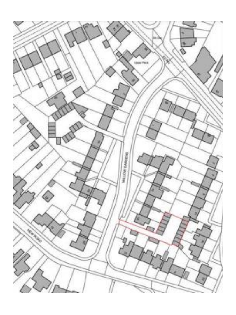
Enlarged Site Location Plan