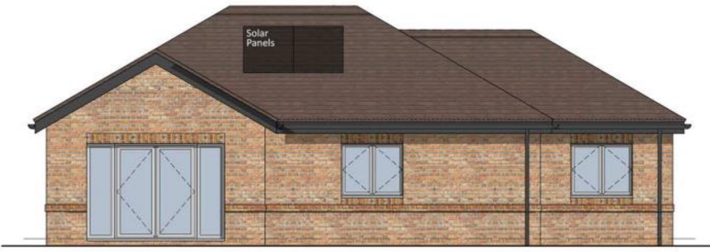
West Elevation towards proposed garden

East Elevation towards 14-18 Church Road